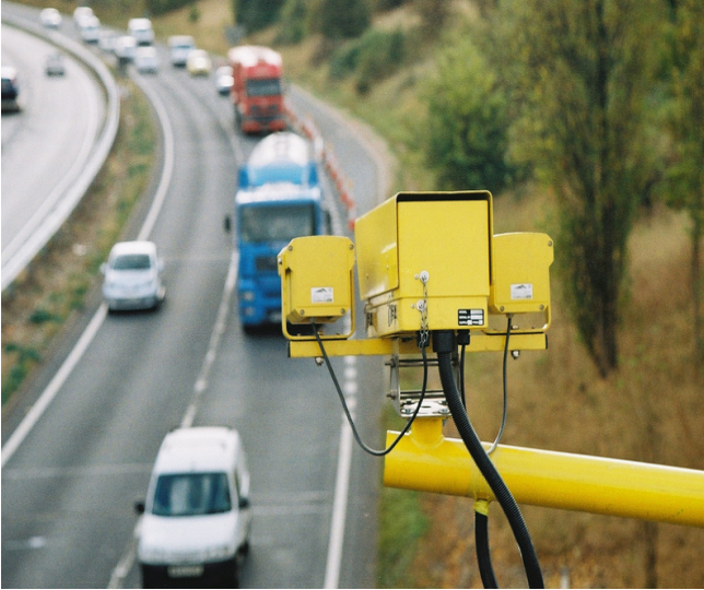
Figure.2. Traffic Enforcement Cameras

In the currently applied methods of information dissemination traffic information is detected, processed and disseminated using integrated, advanced systems [8]. The detectors utilized in ITS include but are not limited to: sensors, cameras, and infrared beacons. Brief overview of some of these detectors is provided.